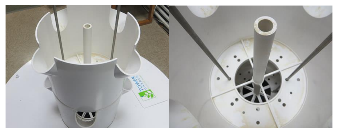
Continue adding sections alternating between hole 'A' and hole 'B'