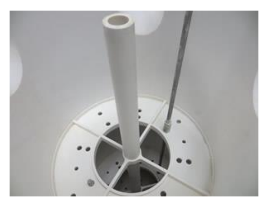
If you purchased the extension, screw the rods in like shown