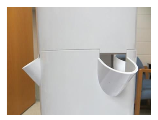
Push the sections down firmly